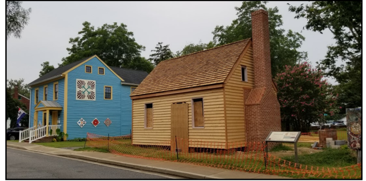
After: Renovations are about complete at 9 N . 4th Street.

If you have driven past the 4th Street Artsway in Denton during the summer, you may have noticed the renovations taking place at 9 N. 4th St.