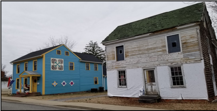
Before: Photo of 9 N 4th (on rt) before renovations began.