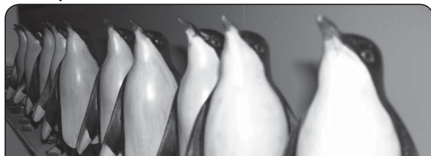
Follow the Leader to Downtown Denton Thursday December 4

This class lasts approximately 1 hour and can be given at your location if you have a group of 5 or more participants. There is no charge for this class.