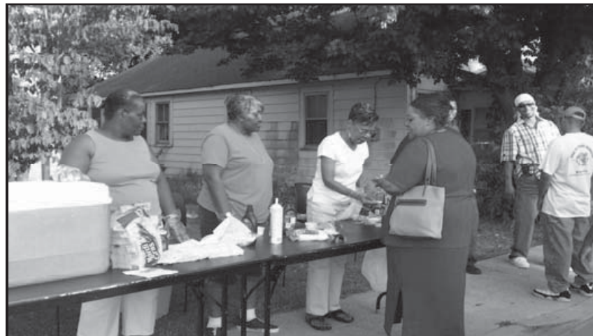
On July 3rd the Helping Hands Neighborhood Association in conjunction with the Denton Police Department hosted an Ice Cream Social at N. 5th and High St. Approximately 100 people were in attendance. Ice cream sundaes were handed out to all who participated.