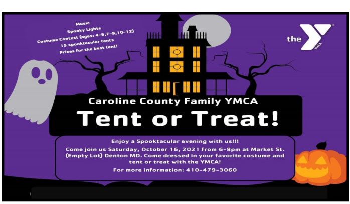
Denton Town News * September — October 2021

Shore (FACES) #410-479-1009 www.fiberartscenter.com