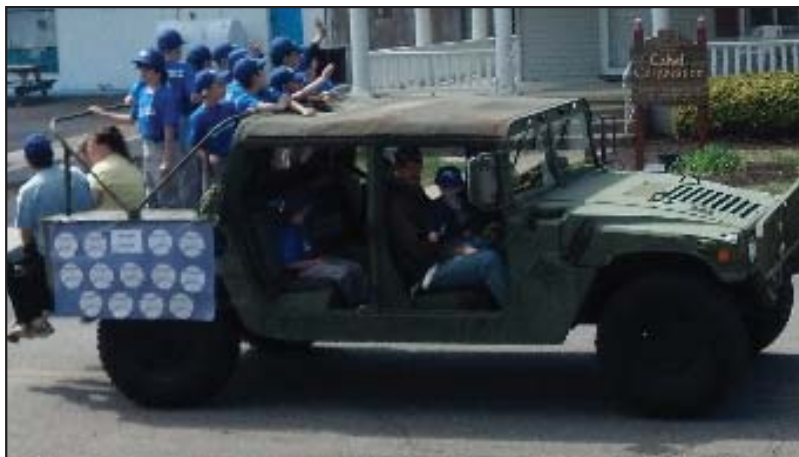
The Denton Police Department Little League team riding in the Opening Day parade in downtown Denton.