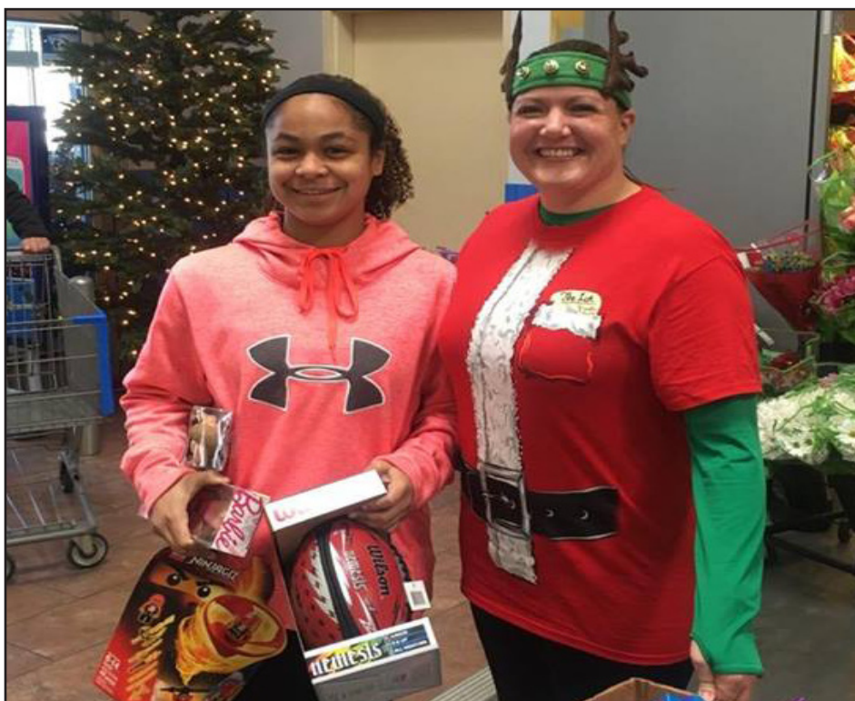
The Denton Police Department collected toys for the Toys for Tots Program at Denton Walmart. The Police Department would like to thank Walmart for their participation and allowing the Police Department to use their locations and a special thank you to the community for donating toys to the program and to children in need.