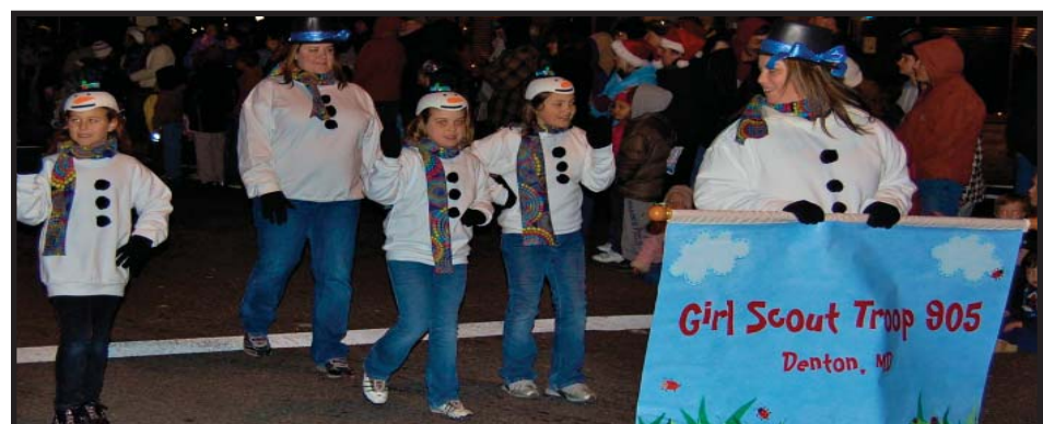
Girl Scout Troop 905