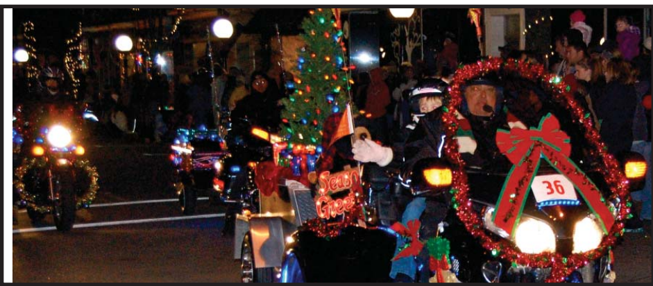
Goldwing Road Riders Association