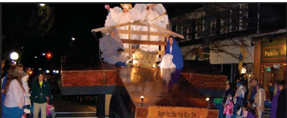
Next Generation Church, Gospel at a Glance