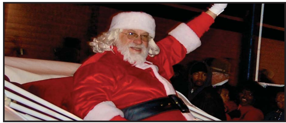
Santa Claus Wishing Denton a Merry Christmas