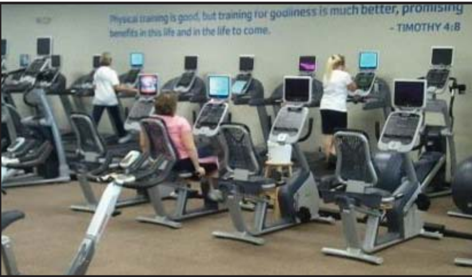
Patrons enjoy a good workout at the new Caroline County YMCA facility located in the Denton Plaza Shopping Center.

The Caroline County YMCA opened in Denton on November 6. This new facility is a branch of the YMCA of the Chesapeake, which also has locations in Easton, St. Michaels and the pool at Chesapeake College. The Y is a non-profit organization whose mission is to foster opportunities for individuals, families and community that strengthen healthy spirit, mind and body, with Christian Principles as their foundation.