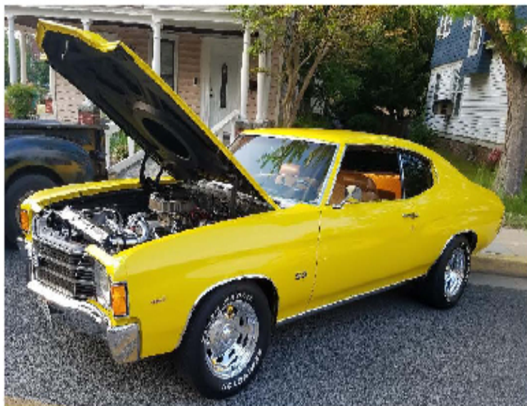
Join us for the 2019