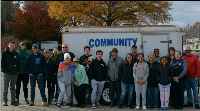
Pictured above: Members of the Denton Town Staff, family members, and local volunteers during the 2021 Turkey Dinner Handout.

On Thanksgiving morning volunteers in Denton and around Caroline County, handed out 125 Thanksgiving dinners to families in need in Denton. This annual tradition has been organized by Neighbors United to Serve (NUTS) since 1992.