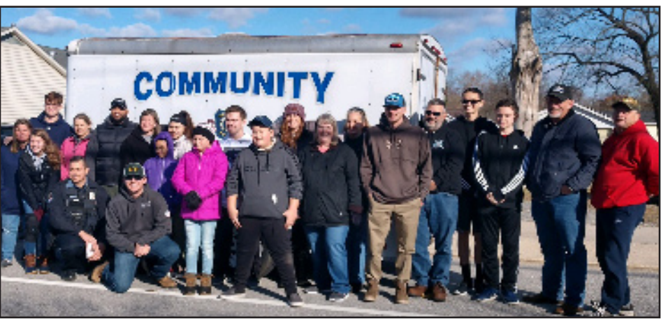
Members of NUTS handed out Thanksgiving dinners the morning of November 28th. Thank you for all they do for the community.

Want to find out when the latest issue of the Denton Town Newsletter is available? Visit our website and get on the email list. www.DentonMaryland.com