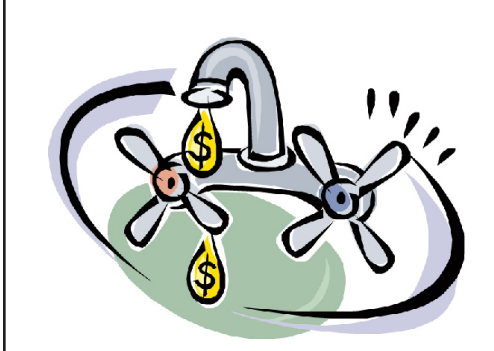
High Water Bills? Check your faucets and toilets for leaks!