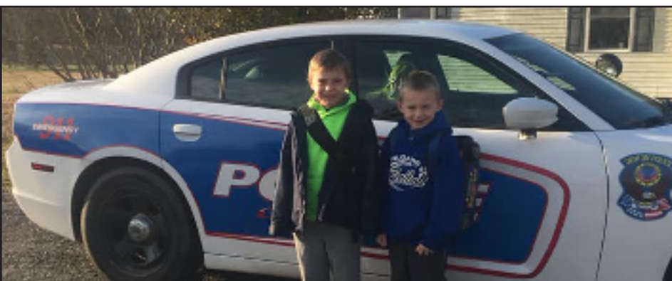
Denton Elementary School held a silent auction during their Harvest Festival and Denton PD donated a ride to school in a police car. The winners of the ride were picked up at their bus stop and driven to school in style.