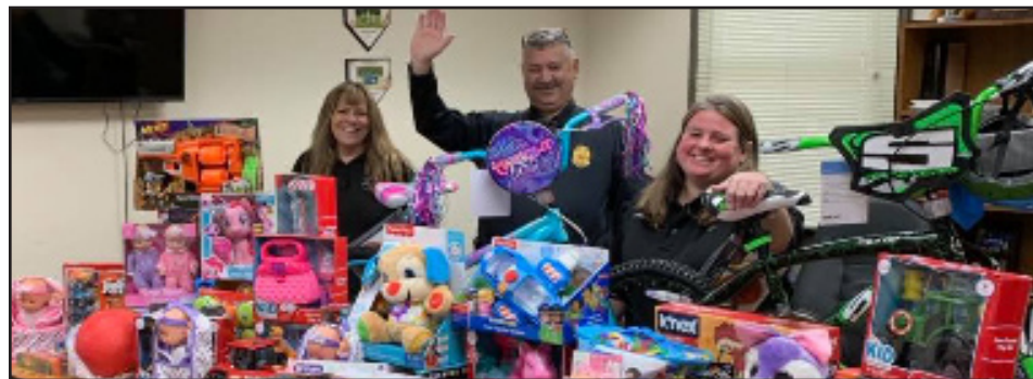
Member of the Denton Police Dept. gathered toys for their annual Toys for Tots drive sponsored by the US Marine Corp.