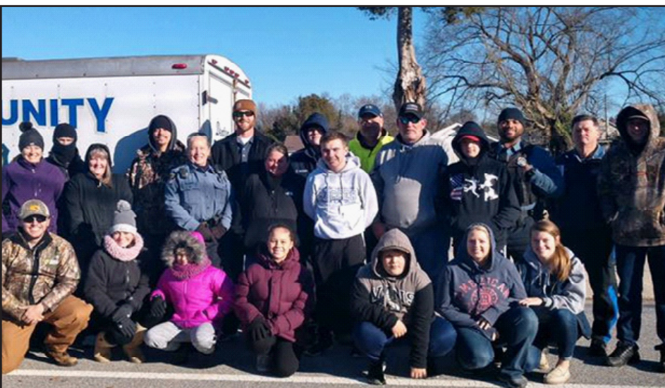
NUTS volunteers came out Thanksgiving morning to deliver turkey dinners. Denton Police, town staff, youth, and neighbors all helped with the process. Thank you to everyone for your support and a special day of deliveries.