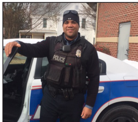
Denton Police Department recently added 2 police officers to their staff.